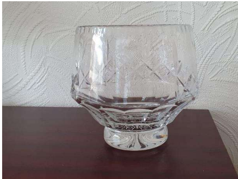
PLATE TROPHY PICTURED/AWAITING BIG TROPHY PICTURE

PRIZES: Trophies presented at the AGM. Winner £15 – runner up £10 (shop or bar credit)